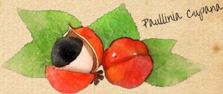
Bright red fruit

Believed to assist with weight loss, enhancing athletic performance, as a stimulant and also to reduce mental and physical fatigue.